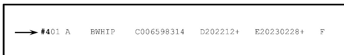
Figure 3.12.16-4 ISRP Error