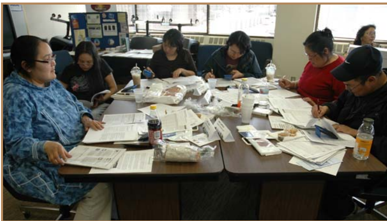
Picture of attendees during April class.

Over the three different sessions, eighty-nine (89) individuals attended. From these eighty-nine attendees, forty-six (46) different tribal governments were represented by 63 attendees. Also represented were four regional nonprofits (8 attendees), six cities (7 attendees), one borough (2 attendees), three village corporations (4 attendees), and the State of Alaska Division of Community & Regional Affairs (2 attendees).