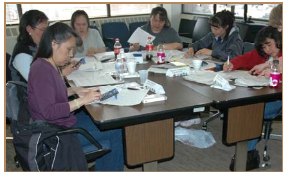
Picture of attendees during April class.