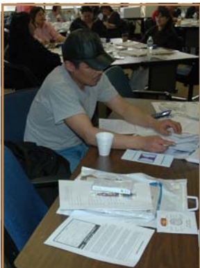
Picture of attendee.