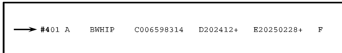
Figure 3.12.16-4 ISRP Error