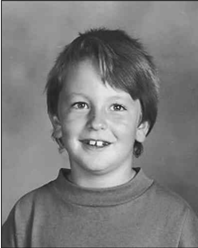
Male, Age Now: 12 Hazel eyes, Brown hair