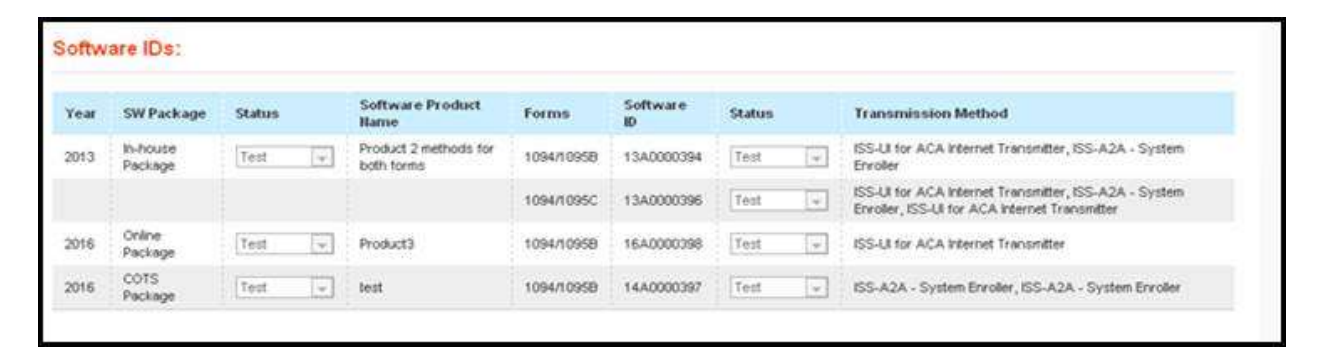
Figure 3-2 Software ID and Status

An example of the Software Package status selected by the Software Developers: